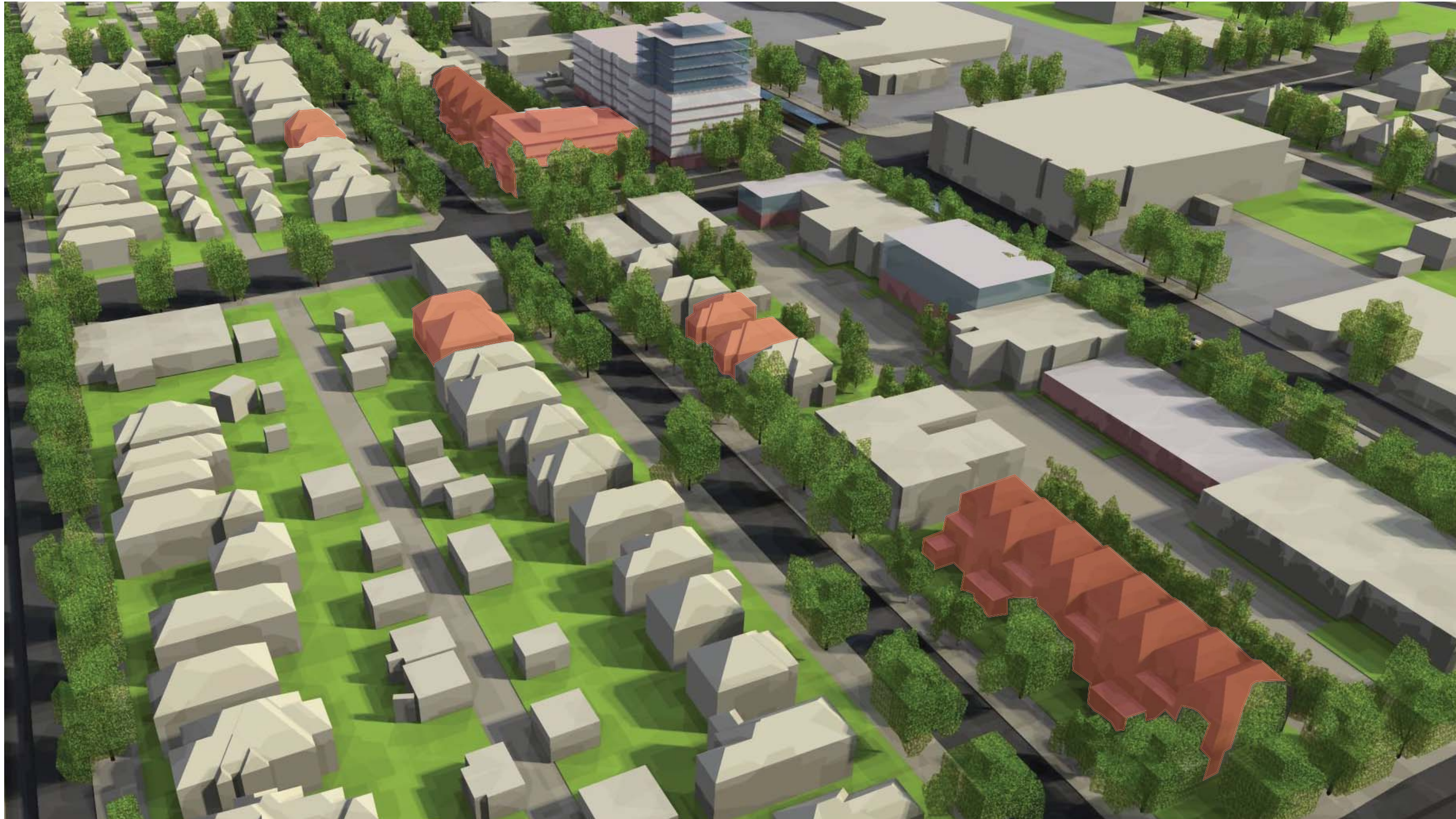
This rendering illustrates how new development (highlighted in orange) can help repair existing residential streets, and reinforce the scale and character of the low-rise neighborhoods to the north and south of University Avenue.