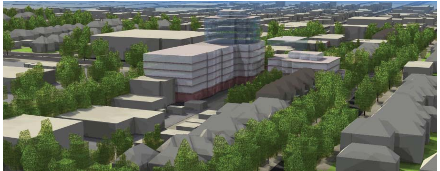
While sites such as this full-depth example above will need to respond to a series of unique conditions in order to achieve good fit and improve conditions along the Corridor, there are some key principles that should be demonstrated by all new development along the Corridor.

While each development type has its own unique set of principles that respond to the range of existing site characteristics, there are common principles that will be important for all new projects.