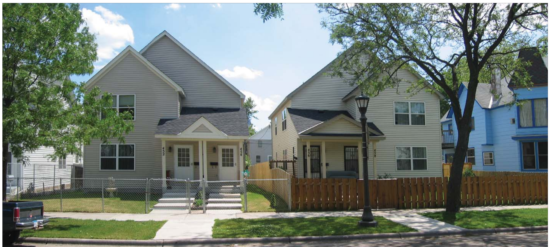
Houses such as these Saint Paul examples demonstrate what investment in low-rise neighborhoods should look like; (from the top left) newer homes gradually filling gaps in the neighborhood; renovations to existing structures; and two new multi-unit buildings that help maintain the scale and character of the street.